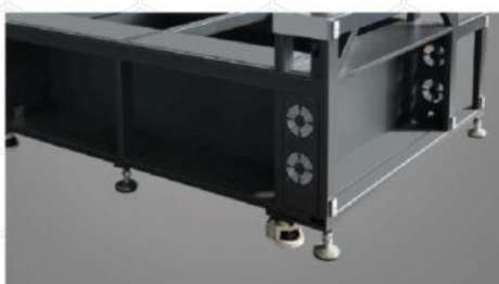
Welding stable machine structure

Adopting honeycomb structure principle, it is strong, anti-corrosion, durable, sound-absorbing and heat insulating.