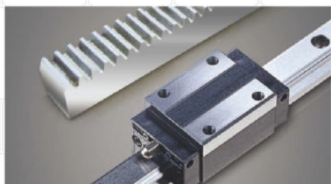
Gear rack & Screw lever

The machine form was welded, avoiding the deviation caused by the vibration when it works. High stable.