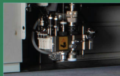
Industrial combination heads

With dual heads, with double cutting efficiency