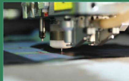
Pneumatic Oscillating Knife Cutting