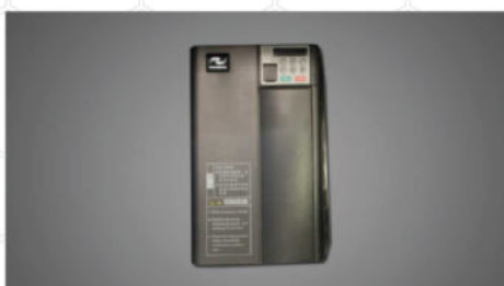
Imported frequency converter

Adopting linear guide from Taiwan as the gear rail, ensures high speed and stable working quality and high accuracy.