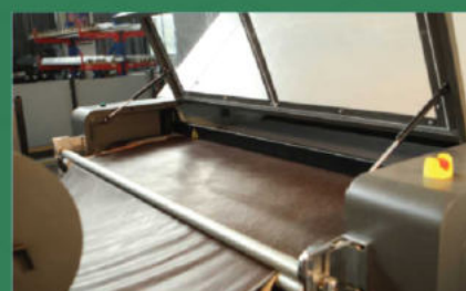
8-layer material Auto feeding system