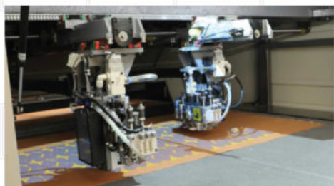
Dual independent working heads.

Adopting advanced frequency converter, it saves power by 30%.